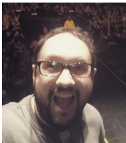
NUMBER ONE SON (1a-6a eastern)

What's up, Rockers! My name is Number One Son, or at least that's what my mother always told me. I'm half Italian, Half Cuban, so I'm a good lover with a bad temper. The Mets and the Jets are my favorite teams, so I go through life with zero expectations. My hobbies include binge watching 1980s anti-drug PSAs. White Cheddar is my blood type. They say that sunlight is the best disinfectant, which explains why I prefer to work the graveyard shift. The first concert I ever attended was MC Hammer. Not only was I traumatized, but it also drove me into a lifelong devotion to real music. Pumps and a Bump is still my jam, though. See you on the radio!