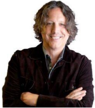
STEVE GORMAN (8p-1a eastern)